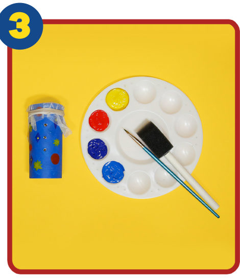
Paint a fun pattern to decorate your kazoo.