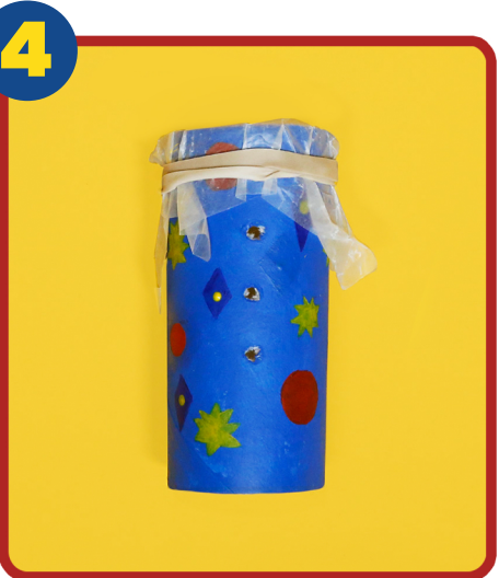
Explore different sounds and have fun!