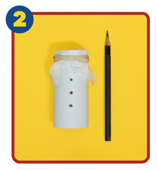
Poke three holes in the side of the tube with a sharp pencil.