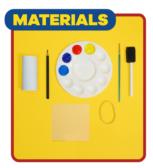
You'll need: Paint, Paint Brushes, Wax Paper, Rubberband, Sharp Pencil, Toilet Paper Roll